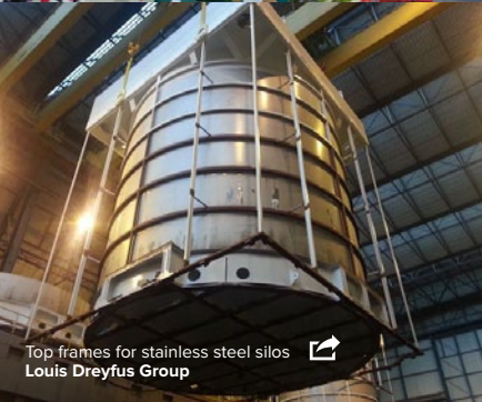
Top frames for stainless steel silos Louis Dreyfus Group