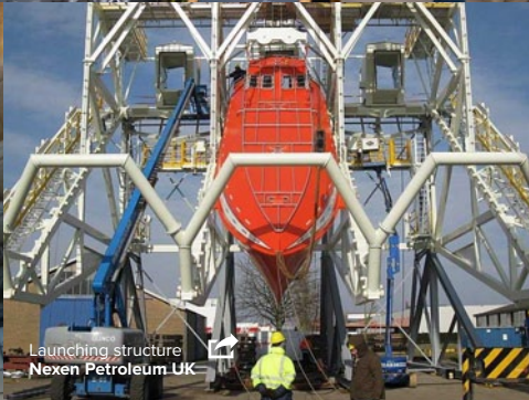
Launching structure Nexen Petroleum UK