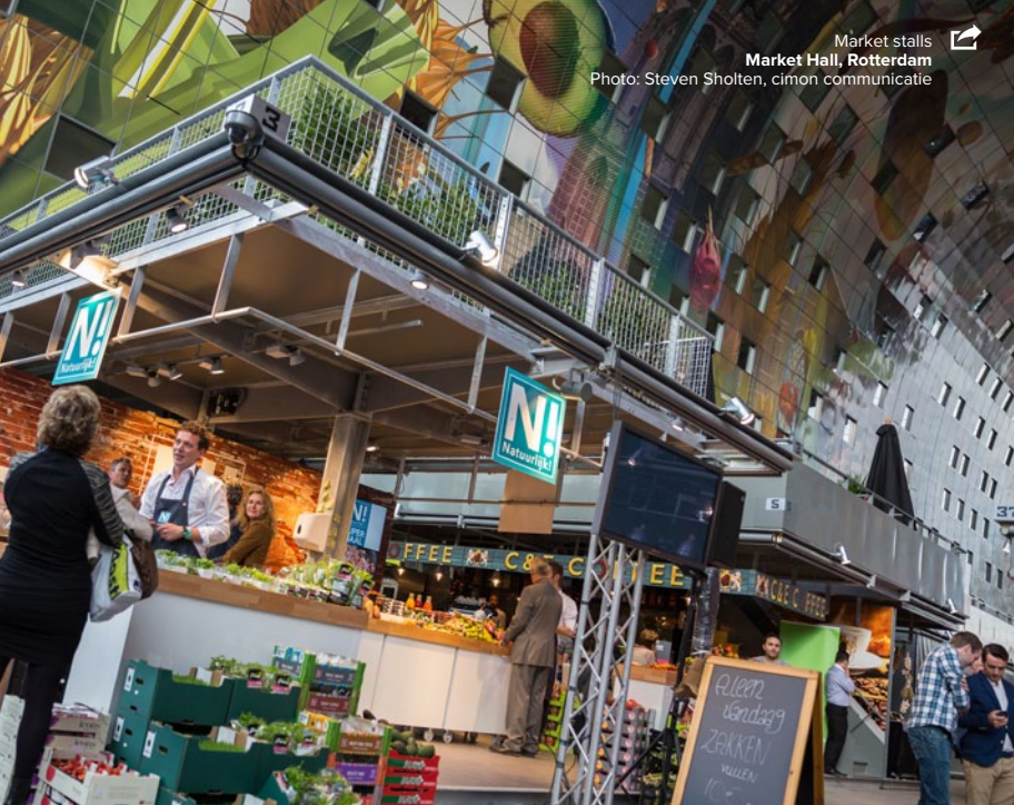
Market stalls Market Hall, Rotterdam