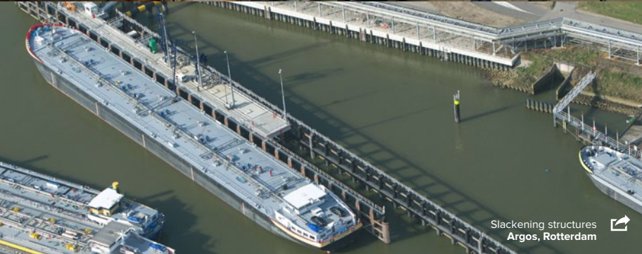
Slacking structures Argos, Rotterdam